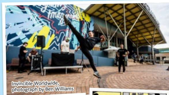
Invincible Worldwide